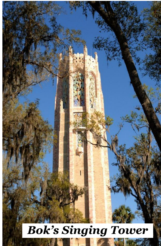
Bok's Singing Tower

Those summer trips to Bok Tower Gardens were like a dream – one from which I never wanted to awaken.