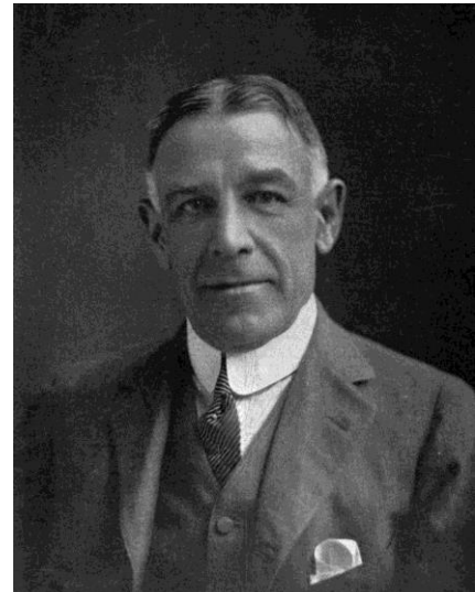
Edward W. Bok

In the years that followed, Bok's vision for the gardens evolved from a mere sanctuary for wildlife to "a sanctuary for the human soul." I can't think of a better way to describe what Bok Tower Gardens is today.