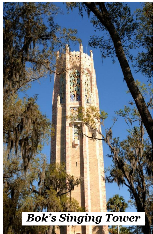
Bok's Singing Tower

If you're planning a spiritual sabbatical this year, here's why you should put Bok Tower Gardens on your shortlist.