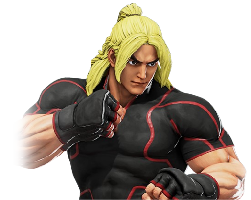
"Ken" from Street Fighter V